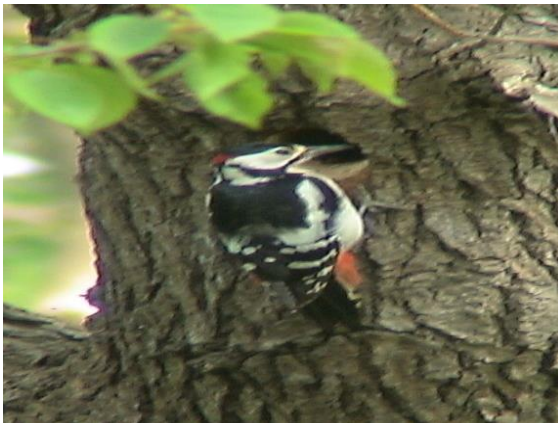
Greater Spotted Woodpecker

Members may have seen that a substantial structure was put up in the wood a little while ago. The Council decided to take it down, a decision which the FQW committee supported because the wood is a local nature reserve, was put up without permission and involved significant damage to nearby coppiced trees. We hope members will support our and the Council's efforts to keep the wood as untouched as possible.