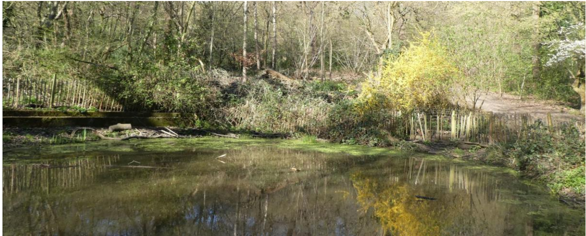
Existing frog pond