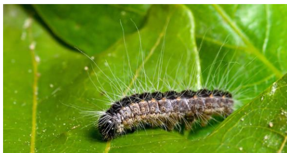
Oak processionary moth caterpillar

MOTH This incomer has now populated all the oak woods around including Queen's Wood and in extreme numbers can cause defoliation. This year a 10% increase in the population is forecast. Risk to the public is small but the Council,