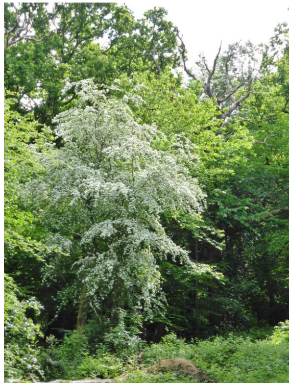
Hawthorn in bloom

Spring has sprung and is continuing and the cold winds mean that blossoms last longer. The warm spells in February and April resulted in wonderful flowers on wood anemones, bluebells, hawthorn and lesser celandines. The word Celandine means 'swallow' and was supposed to arrive with the birds of that name but in fact appears as early as February. Richard Mabey suggests that the reference is to the Greater Celandine which does appear later and is less common in Queen's Wood. Another local