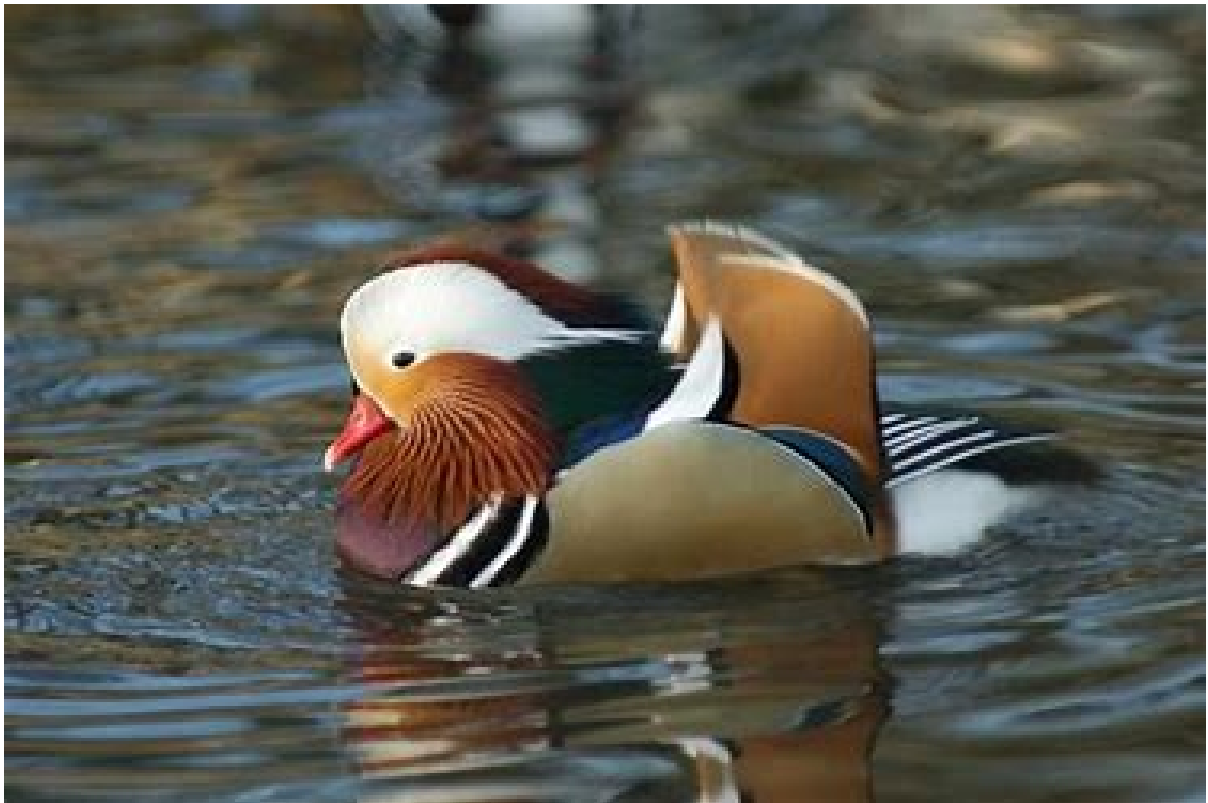
Mandarin Duck in Frog Pond

The old daffodils near the Muswell Hill entrance have very few flowers this year. This could be because they are overcrowded. Rather than divide them up and replant a creative idea might be to take them all out and replace with small delicate native daffodils – the Lenten Lilies which are the subject of Wordsworth's famous poem. A good task for volunteers in the autumn when we hope things are more normal.