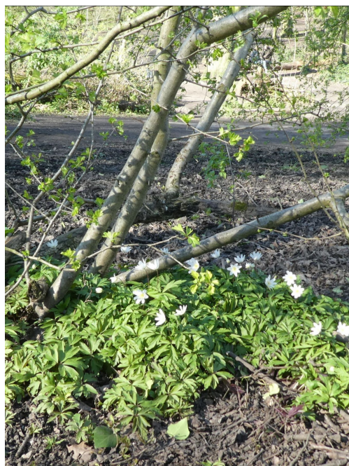
Wood anemones

It is good news that Highgate Wood is still open for walkers as this will lessen the pressure on Queen's Wood. So many of our trees are under threat from trampling as their roots are exposed with bare earth right up to the base. In a few places, though, the wood anemones persist at the bole protected by the trunk and these are often on the north side of a tree. Is this because there is a damper environment there? An interesting study perhaps for someone to check the aspect North, South, East and West of all the trees where a few anemones grow.