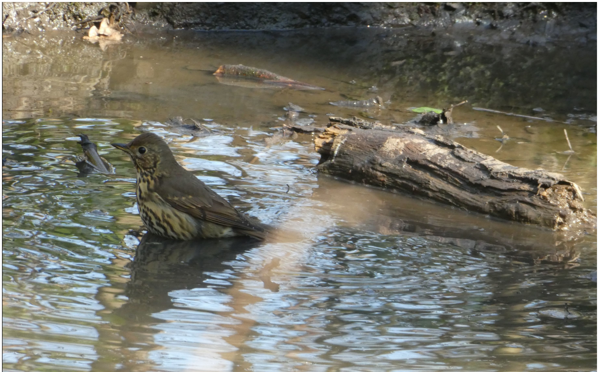
Song Thrush in Dog pond