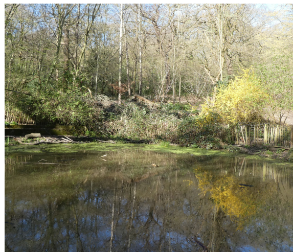
Frog pond - photo Michael Johns

After a dreary, mild and wet autumn and early winter the woods are very muddy and the streams and drainage channels full of water and blocked with leaves. The ponds are all full but the flags, yellow irises, are showing above the water. With these high temperatures we can expect frog spawn in the next few weeks- sometimes as early as March 10 th .