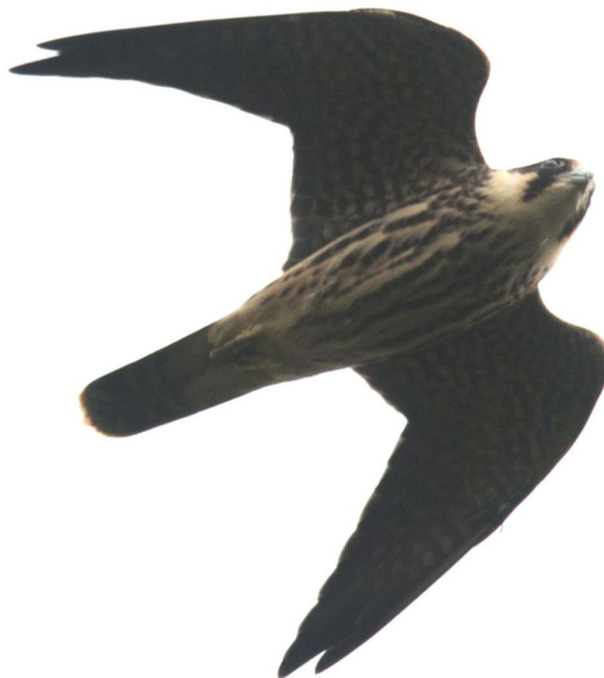
Eurasian Hobby, over Queen's Wood