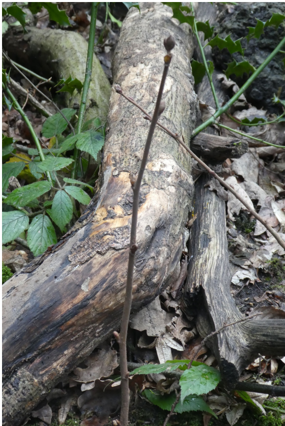
Newly planted hazel whip

bird/bat boxes have been installed near the Priory Gardens entrance to the wood.