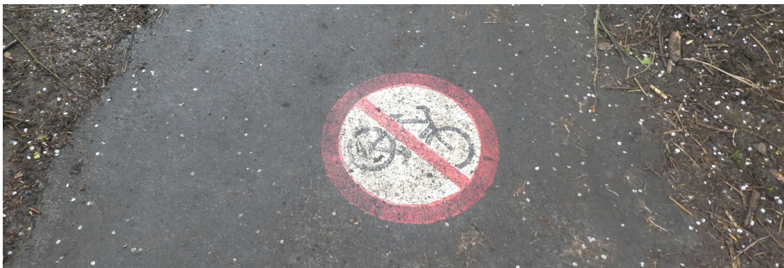
No cycling sign, Connaught Gardens entrance

Last year, in the run up to the Green flag review, the council managed to allocate some funds to repair and improve facilities in the wood. We suggested priorities, and significant repairs were made to the worst of the paths near the Lodge, at the Connaught Gardens entrance and between the Wood Vale entrance and the Frogpool. The handrail in the Priory Gardens entrance was repaired and extended, and 'No Cycling' notices painted at the main entrances. We are in discussion with the council about possible work this year, mainly concentrated on further path improvements. The council has also started to replace old litter bins with a standard new design in all open spaces.